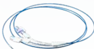
3-lumen stone extraction balloon from MICRO-TECH